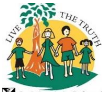
St Martin's School